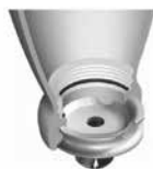
Single lamination Icelock Stainless Steel Pyramid 773