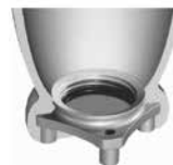
Single lamination Icelock Alloy 4-hole 774