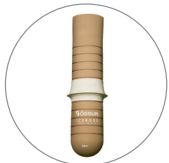
Seal-In® X TF liner