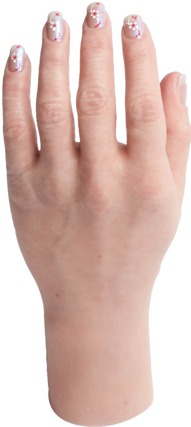
various options available